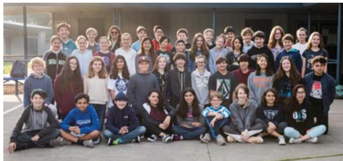
The Jukebox cast and crew of "All Shook Up Young@Part Edition" during one of the rehearsals.

Orinda Intermediate School's Bulldog Theater will present the musical, "All Shook Up Young@Part" April 26-28 at OIS. "All Shook Up" tells the story of an unexpected small town romance through classic rock 'n' roll music. Tomboy Natalie, who runs the local mechanics shop, dreams of life beyond her dull little hometown. The whole town